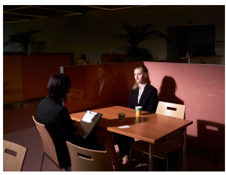
CONTINENT – In Search of Europe Frank Schinski No Title, from the series The Right Attitude, since 2017