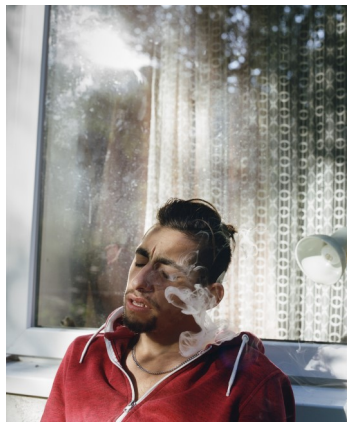
CONTINENT – In Search of Europe Sibylle Fendt Sezar Krout, 2016, from the series Holzbachtal, nothing, nothing, 2015–2018

Press images are provided free of charge solely for the current coverage of an exhibition. The images may neither be modified, cropped or overprinted. Any such changes to the images are only possible with prior permission in writing. Press images are to be deleted from all online media four weeks after an exhibition has ended. Use free-of-charge for the permanent promotion of the exhibition is possible. Further motives subject to charge upon request. For login details for downloads please contact +49 (0)30 200 57-1514 or send an e-mail to presse@adk.de.