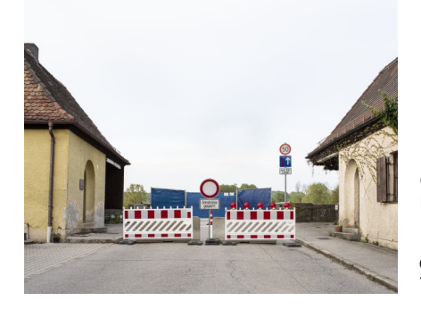
CONTINENT – In Search of Europe Heinrich Voelkel German – Austrian border crossing, Tittmoning, from the series No Easy Way Out, 2020 Trimming of the motif is not permitted.