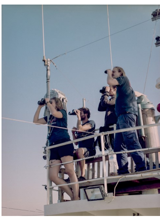
CONTINENT – In Search of Europe Annette Hauschild Crew monitoring the sea, Mission Lifeline, civilian rescue ship on the Mediterranean, 2017, from the series The Helpers, 2016–2018