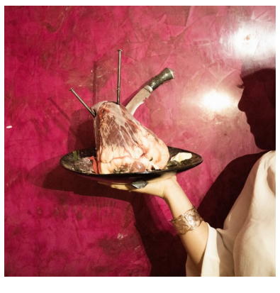
CONTINENT – In Search of Europe Johanna-Maria Fritz Cassandra holds up the heart of an ox, 2019, from the series The Most Powerful Witch of Europe, 2018–2020

Press images are provided free of charge solely for the current coverage of an exhibition. The images may neither be modified, cropped or overprinted. Any such changes to the images are only possible with prior permission in writing. Press images are to be deleted from all online media four weeks after an exhibition has ended. Use free-of-charge for the permanent promotion of the exhibition is possible. Further motives subject to charge upon request. For login details for downloads please contact +49 (0)30 200 57-1514 or send an e-mail to presse@adk.de .