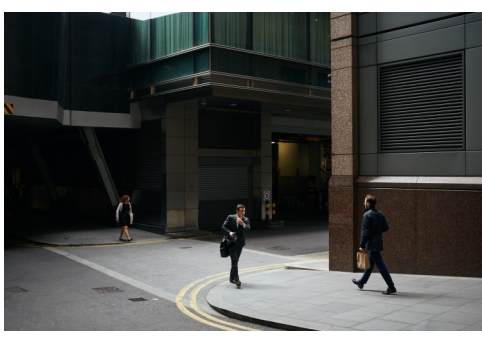
CONTINENT – In Search of Europe Dawin Meckel Pindar Street, 2017, from the series The Wall, 2017/2018