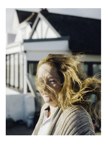
CONTINENT – In Search of Europe Tobias Kruse Unknown Passerby, 2016, from the series Jaywick, 2016/2020