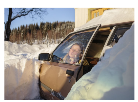
CONTINENT – In Search of Europe Espen Eichhöfer Bil , from the series Papa, Gerd and the Northman , 2017–2020