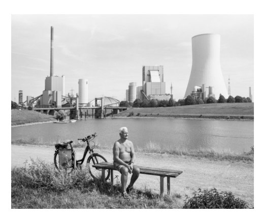
CONTINENT – In Search of Europe Ute Mahler and Werner Mahler The Rhine near Walsum , 2019, from the series On the River s, 2019–2020