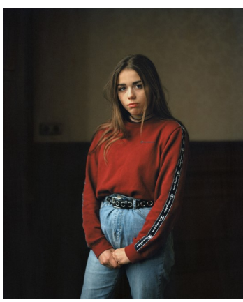
CONTINENT – In Search of Europe Ina Schoenenburg Young Girl in the encounter and education centre, Trebnitz Castle, 2019, from the series Związki, 2016–2020