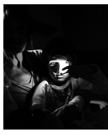
CONTINENT – In Search of Europe Linn Schröder "At Home: Mother Not There." Kloster Lehnin, 2017, from the series "Not Again, Grandma, Mom", 2017–2020